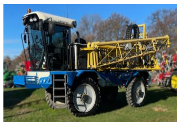
Househam Merlin M4-32 208799 (A) Merlin M4-32, Self-Propelled Sprayers, 2015, 5800 hours, 235hp, Used, Hydrostatic, 50 $243,000.00+GST