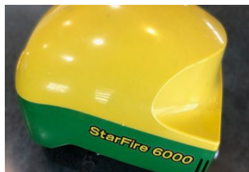
John Deere SF6000 208560 (B) SF6000, Precision Ag Technology, 2020, Used $10,900.00+GST