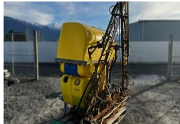
C-Dax 1000i 10m Sprayer 208794 (K) 1000i 10m Sprayer, Spraying & Spreading, 2010, Used $8,500.00+GST