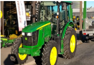
John Deere 5090R 208622 (B) 5090R, 540/540E/1000E, Tractor, 2018, 3850 hours, 90hp, Used, MFWD, Command 8, 40 $63,500.00+GST