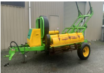
Read 2 Bale Feeder 208915 (T) 2 Bale Feeder, Feeding Out, 2020, 0 hours, Used $6,000.00+GST