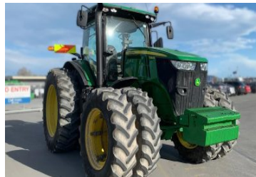
John Deere 7230R 208451 (C) 7230R, 189, Tractor, 2018, 3777 hours, 230hp, 540/1000, Used, Triple Link $174,000.00+GST