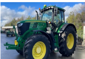
John Deere 6215R 208910 (C) 6215R, Tractor, 2018, 4915 hours, 215hp, Used, 205, 540/1000 RPM, MFWD, $194,000.00+GST