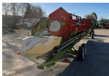
Claas Vario 1050 Header 208917 (T) Vario 1050 Header, Implement or Attachment, 2011, Used $45,000.00+GST