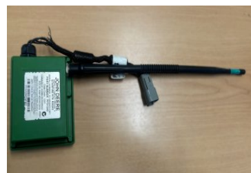
John Deere 900 RTK Radio 208922 (A) 900 RTK Radio, Precision Ag Technology, 2012, Used $1,100.00+GST