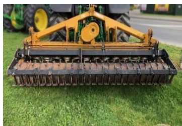
Alpego RH 300 208678 (C) RH 300, Cultivation & Seeding, 2014, Used $16,000.00+GST