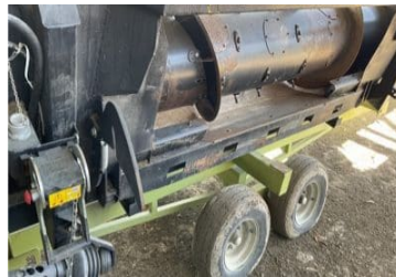
Claas P516 PICK UP FRONT 208570 (T) P516 PICK UP FRONT, Combine Harvester, 2011, Used $32,000.00+GST