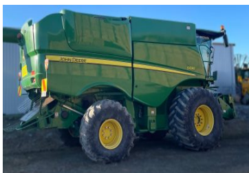
John Deere S690 208691 (A) S690, Combine Harvester, 2013, 2292 hours, 600hp, 2 Range Hydro, Used, 40 km/h, $470,000.00+GST