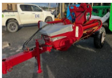
Giltrap G2x2 Feeder 208903 (K) G2x2 Feeder, Feeding Out, 2018, Used $15,000.00+GST