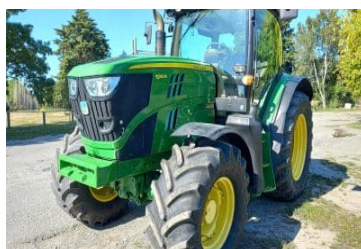
John Deere 6130R 208354 (A) 105, 6130R, Tractor, 2012, 7146 hours, 130hp, Used, 540/540E/1000E, TLS Front $63,000.00+GST