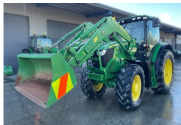
John Deere 6145R 208909 (C) 6145R, Tractor, 2016, 5205 hours, 145hp, Used, 134, 540/1000 RPM, MFWD, $128,000.00+GST