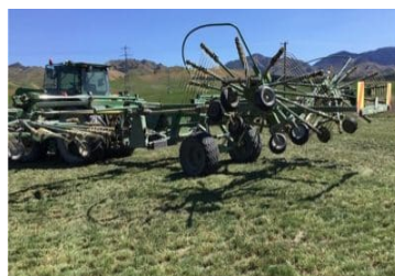
Krone Swadro 1400 Plus 208783 (C) Swadro 1400 Plus, Hay & Forage, 2016, 12000 hours, Used $69,000.00+GST