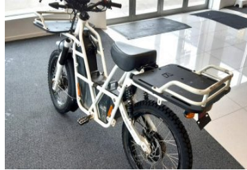
Ex Demo White Ubco Electric Bike 117715 (C) 2x2, Motorbike or Utility Vehicle, 2020, N/A, $6,082.61+GST