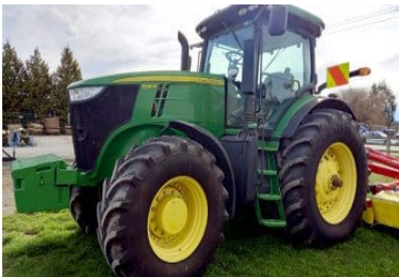
John Deere 7230R 207267 (O) 7230R, Tractor, 2013, 5715 hours, 230hp, 4WD, Used, IVT, 4 Rear SCV's, 600/70 R30, $118,000.00+GST