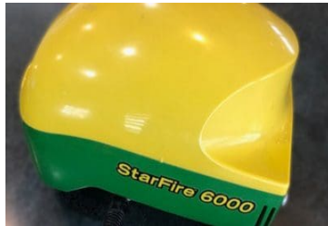
John Deere SF6000 208560 (B) SF6000, Precision Ag Technology, 2020, Used $10,900.00+GST