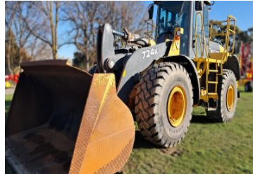
John Deere 724K 208603 (A) 724K, Construction, 2011, 13500 hours, 264hp, 5 Speed Auto, Used $169,000.00+GST

Hours, condition and price subject to change without notice.