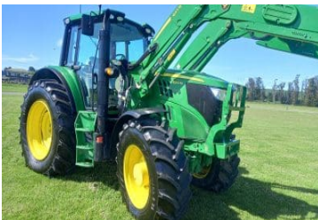
John Deere 6140M 209015 (T) 6140M, Tractor, 2022, 1020 hours, 140hp, Used, TLS Front Suspension, PowerQuad, $160,000.00+GST