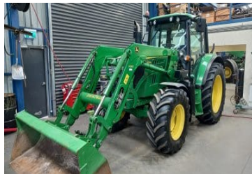
John Deere 6125M 208925 (C) 6125M, Tractor, 2014, 6619 hours, 132hp, Used, 109, 540/540E/1000, MFWD, $65,000.00+GST