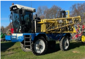
Househam Merlin M4-32 208799 (A) Merlin M4-32, Self-Propelled Sprayers, 2015, 5800 hours, 235hp, Used, Hydrostatic, 50 $243,000.00+GST