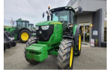
John Deere 6170R 208040 (C) 6170R, 165 HP Rated, Tractor, 2013, 6100 hours, 170hp, 540/540E/1000, Used, MFWD, $98,000.00+GST