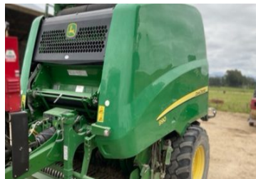
John Deere 990 Baler 208841 (T) 990 Baler, Hay & Forage, 2018, 18000 hours, Used $60,000.00+GST