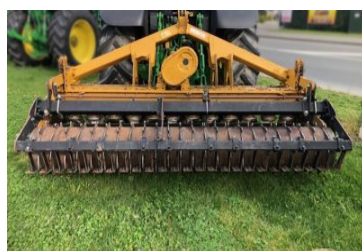
Alpego RH 300 208678 (C) RH 300, Cultivation & Seeding, 2014, Used $16,000.00+GST