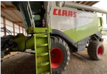
Claas Lexion 580+ Hybrid 208889 (A) Lexion 580+ Hybrid, Combine Harvester, 2007, 3627 hours, 509hp, Used, Hydrostatic, $170,000.00+GST