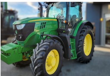
John Deere 6155R 208848 (O) 6155R, Tractor, 2016, 5890 hours, 155hp, Used, 140, 540/1000, Triple Link Suspension, $121,000.00+GST