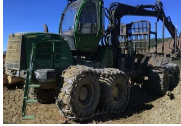
John Deere 1910E 207835 (C) 1910E, Forestry, 2014, 12200 hours, 249hp, Used, Hydrostatic, 750/55x26.5, 750/55x26.5 $240,000.00+GST