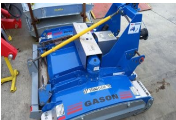
Gason Rapier 1.8M Mower 124489 (I) New, 2021 $27,429.00+GST $20,250.00+GST