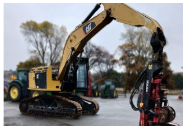
Caterpillar 330D 2L 208675 (O) 330D 2L, Forestry, 2017, 10523 hours, Hydrostatic, 266hp, Used, $275,000.00+GST