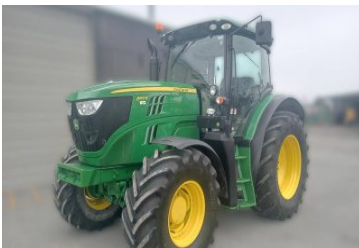
John Deere 6140R 208851 (T) 6140R, Tractor, 2014, 3250 hours, 140hp, Used, TLS MFWD, AutoQuad, 3 Rear SCV's, $123,000.00+GST