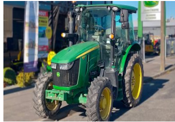
John Deere 5100R 208857 (B) 5100R, Tractor, 2018, 7399 hours, 100hp, Used, 540/540E/1000, MFWD, Command 8, $39,000.00+GST