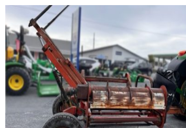
Taegre 2 Bale Feeder 207971 (K) 2 Bale Feeder, Feeding Out, 1, Used $7,500.00+GST

Hours, condition and price subject to change without notice.