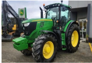
John Deere 6215R 208879 (O) 6215R, Tractor, 2016, 5800 hours, 215hp, Used, 180, 540/1000, TLS with Brakes, $130,000.00+GST