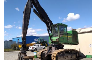
John Deere 909KH 208212 (C) 909KH, Forestry, 2011, 13805 hours, 300hp, Hydrostatic, Used $275,000.00+GST