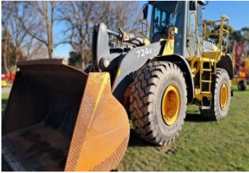
John Deere 724K 208603 (A) 724K, Construction, 2011, 13500 hours, 264hp, 5 Speed Auto, Used $169,000.00+GST