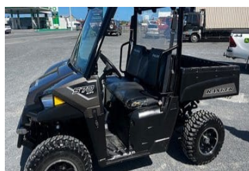
Polaris Ranger 570 HD 208989 (K) Ranger 570 HD, Motorbike or Utility Vehicle, 2022, 1226 hours, 44hp, Used $14,950.00+GST