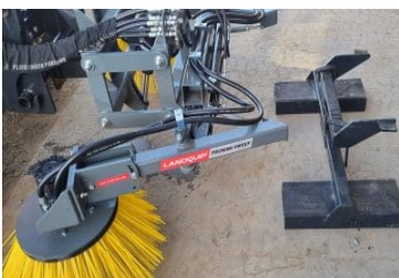
Landquip Vineyard Sweeper 208680 (B) Vineyard Sweeper, Miscellaneous, 2022, Used $17,600.00+GST