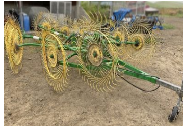
Paddon RP10 208470 (A) RP10, Hay & Forage, 2015, Used $10,000.00+GST