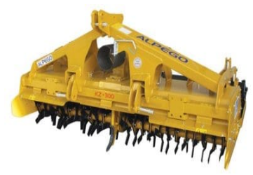
Alpego KH300 Rotopick 208208 (R) KH300 Rotopick, Cultivation & Seeding, 2017, Used $27,500.00+GST