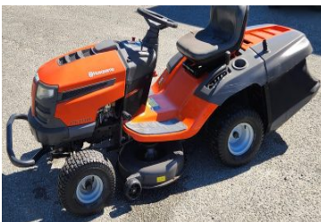
Husqvarna CTH2138R 208475 (O) CTH2138R, Ride-on Mower, 2013, 266 hours, 20hp, Hydrostatic, Used, $4,521.74+GST