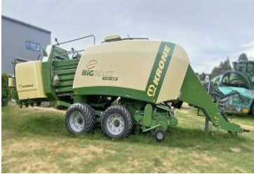
Krone Big Pack 1290 HDP 208689 (A) Big Pack 1290 HDP, Hay & Forage, 2013, 0 hours, Used $164,000.00+GST