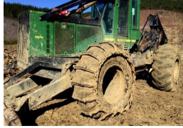
John Deere 648H 207834 (C) 648H, PowerShift, Forestry, 2007, 13469 hours, 185hp, Used, 30.5x32, 30.5x32 $80,000.00+GST