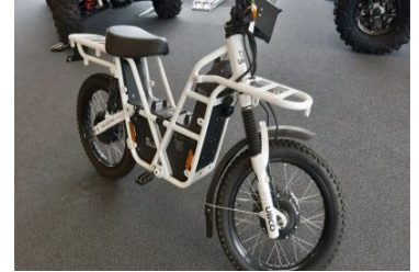
New White Ubco Electric Bike 117718 (G) 2x2, Motorbike or Utility Vehicle, 2020, N/A, $6,517.39+GST