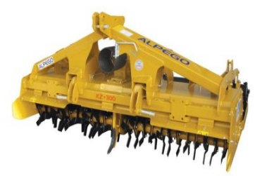
Alpego KH300 Rotopick 208208 (R) KH300 Rotopick, Cultivation & Seeding, 2017, Used $27,500.00+GST