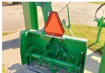
Frontier SB1148 193301 (T) SB1148, New, Miscellaneous, 2015 $3,585.00+GST