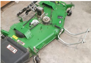
John Deere 60D Deck 207846 (T) 60D Deck, Ride-on Mower, 2020, Used, $4,400.00+GST