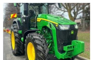
John Deere 8R340 208911 (A) 8R340, Tractor, 2022, 2353 hours, 340hp, 284, Used, ILS, PowerShift, 40 km/h, 227 $395,000.00+GST

Hours, condition and price subject to change without notice.