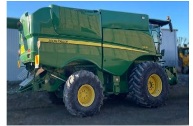
John Deere S690 208691 (A) S690, Combine Harvester, 2013, 2293 hours, 600hp, 2 Range Hydro, Used, 40 km/h, $470,000.00+GST