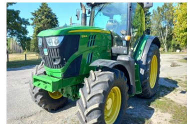
John Deere 6130R 208354 (A) 105, 6130R, Tractor, 2012, 7146 hours, 130hp, Used, 540/540E/1000E, TLS Front $63,000.00+GST