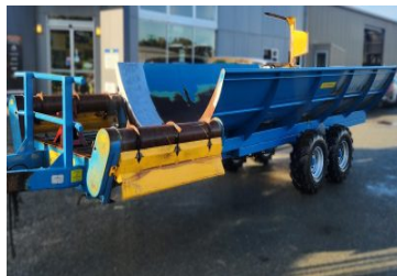
Scannell 5 Bale Feeder 208814 (O) 5 Bale Feeder, Feeding Out, 2008, Used $19,950.00+GST