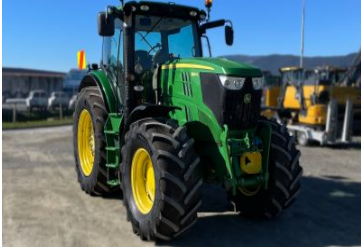
John Deere 6190R 208928 (N) 6190R, Tractor, 2013, 5697 hours, 190hp, Used, 157, 540/540E/1000, TLS, Direct Drive, $108,000.00+GST