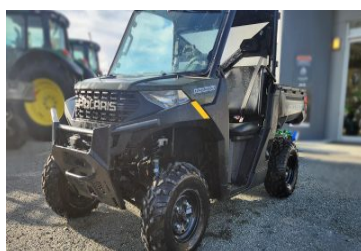
Polaris Ranger 1000 EPS 208505 (O) 999, RANGER 1000 EPS, Motorbike or Utility Vehicle, 2022, 21 hours, 82hp, Used, CVT $22,000.00+GST