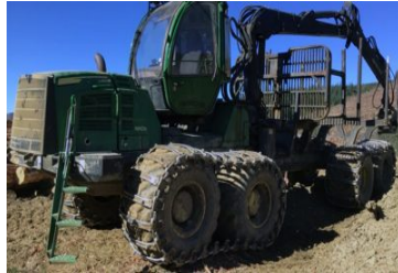
John Deere 1910E 207835 (C) 1910E, Forestry, 2014, 12200 hours, 249hp, Used, Hydrostatic, 750/55x26.5, 750/55x26.5 $240,000.00+GST