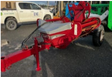
Giltrap G2x2 Feeder 208903 (K) G2x2 Feeder, Feeding Out, 2018, Used $15,000.00+GST