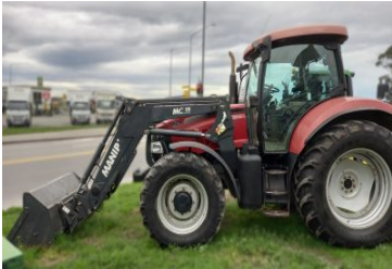
Case Maxxum 125 208881 (C) Maxxum 125, Tractor, 2012, 4118 hours, 126hp, Used, 110, 540/1000, MFWD, $65,000.00+GST