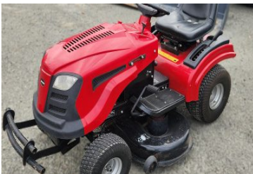
Sanli Tandem THB 1066A 208793 (O) Hydrostatic, THB 1066A, Ride-on Mower, 2015, 125 hours, 18hp, Used, $3,217.39+GST