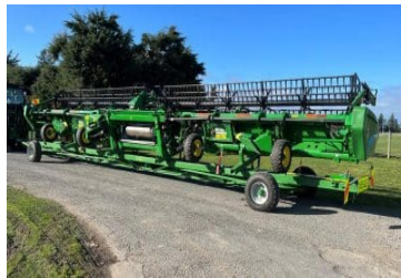
John Deere HD45X Harvester Header 124485 (A) HD45X, 2022, New $320,000.00+GST