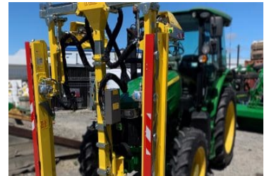
KMS Standard Double Row Leaf Trimmer 119249 Standard Double L Trimmer, Implement or Attachment, 2011, Used $37,500.00+GST