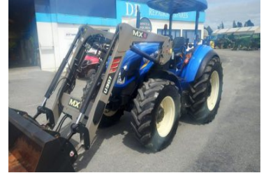
New Holland T4.105 208028 (A) T4.105, Tractor, 2013, 3022 hours, 106hp, Used, 92, 4WD, 12 Speed Synchro, MX U307 $49,000.00+GST