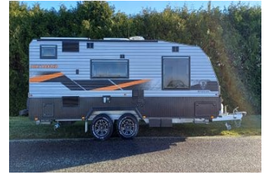
2021 JB Dirt Roader 208846 $98,256.52+GST

Hours, condition and price subject to change without notice.