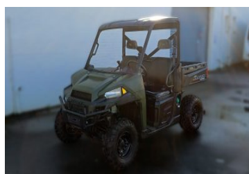
Polaris Ranger 1000 Diesel 208552 (D) Ranger 1000 Diesel, Motorbike or Utility Vehicle, 2015, 1000, 24hp, CVT, Used, 30 $11,300.00+GST