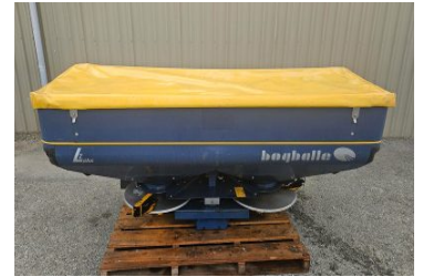
Bogballe L2 plus 208765 (T) L2 Plus, Spraying & Spreading, 2007, Used $6,250.00+GST