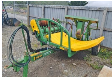
Hustler Chainless 4000 209008 (G) Chainless 4000, Miscellaneous, 2017, Used $9,000.00+GST