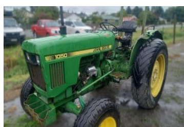
John Deere 1050 Rops 208123 (R) 1050 Rops, Tractor, 1985, 33, 7855 hours, 37hp, Used, 540, 4WD, 4 Speed 2 Range, $9,500.00+GST