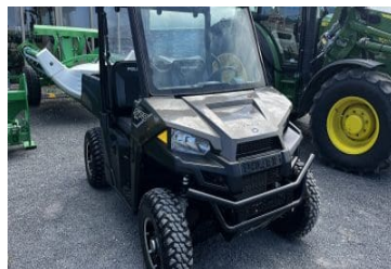
Polaris 570 HD Ranger 208984 (K) 570 HD Ranger, Motorbike or Utility Vehicle, 2022, 1308 hours, Used $14,950.00+GST