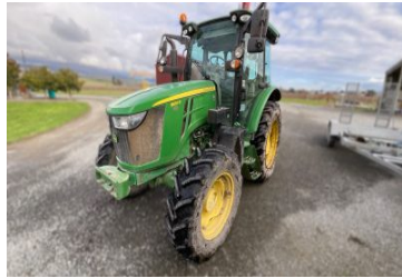
John Deere 5100R 208937 (B) 5100R, Tractor, 2018, 4621 hours, 100hp, Used, 540/540E/1000, MFWD, Command 8, $54,000.00+GST