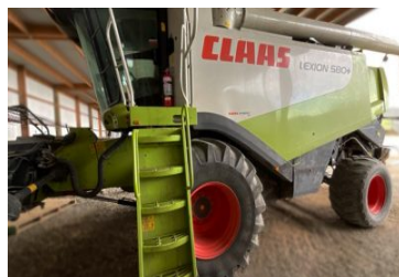
Claas Lexion 580+ Hybrid 208889 (A) Lexion 580+ Hybrid, Combine Harvester, 2007, 3627 hours, 509hp, Used, Hydrostatic, $170,000.00+GST