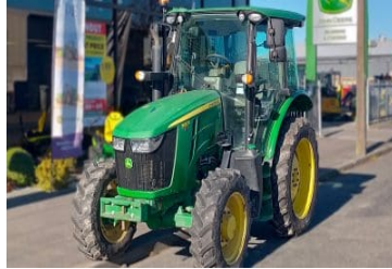
John Deere 5100R 208857 (B) 5100R, Tractor, 2018, 7399 hours, 100hp, Used, 540/540E/1000, MFWD, Command 8, $39,000.00+GST