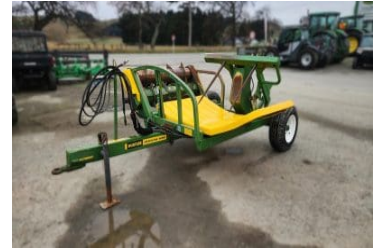
Hustler CH4000 208914 (O) CH4000, Feeding Out, 2011, Used $12,300.00+GST