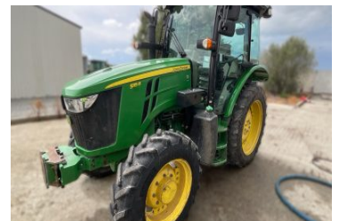
John Deere 5115R 208858 (B) 5115R, Tractor, 2018, 7588 hours, 115hp, Used, 540/540E/1000, MFWD, Command 8, $43,000.00+GST

Hours, condition and price subject to change without notice.