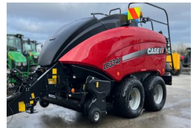
Case LB334P 208939 (C) LB334P, Hay & Forage, 2018, 67000 hours, Used $85,000.00+GST