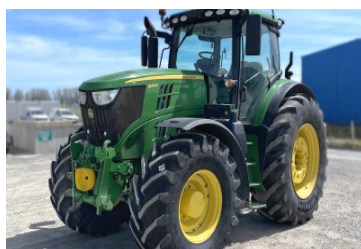
John Deere 6215R 208774 (N) 6215R, 177, Tractor, 2017, 4890 hours, 215hp, Used, 540/540E/1000E, TLS $210,000.00+GST