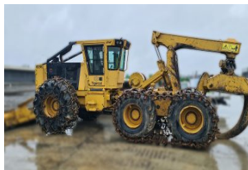
Tigercat 625E 208868 (C) 625E, Forestry, 2018, 5200 hours, 221hp, Hydrostatic, Used, $350,000.00+GST