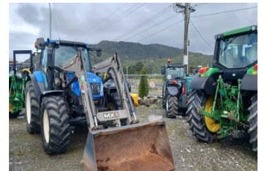
New Holland T6070 208980 (G) T6070, Tractor, 2017, 4511 hours, 140, Used, 3, Cab, MX Loader, Cultore 480/65R28, $74,000.00+GST