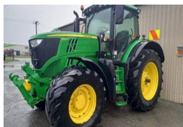
John Deere 6195R 208898 (T) 6195R, Tractor, 2020, 4405 hours, 195hp, Used $210,000.00+GST