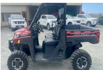
Polaris Ranger XP 1000 208679 (N) 999, Ranger XP 1000, Motorbike or Utility Vehicle, 2018, 1601 hours, 82hp, CVT, Used $15,000.00+GST