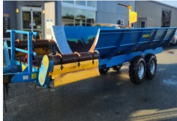
Scannell 5 Bale Feeder 208814 (O) 5 Bale Feeder, Feeding Out, 2008, Used $19,950.00+GST