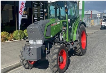
Fendt 209P Vario 208946 (B) 209P, 2020, 484 hours, 90hp, 540/540E/1000, TLS, CVT, 40 km/h, 65 L/min, $135,000.00+GST