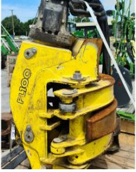
John Deere FL100 208394 (C) FL100, Forestry, 2021, 456 hours, Used $100,000.00+GST