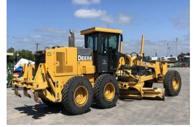
John Deere 772CH 208934 (C) 772CH, Construction, 2003, 17116 hours, 200hp, Used, PowerShift, 17.5R25, 17.5R25 $85,000.00+GST