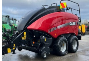
Case LB334P 208939 (C) LB334P, Hay & Forage, 2018, 67000 hours, Used $85,000.00+GST