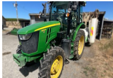
John Deere 5090R 208877 (B) 5090R, Tractor, 2018, 4057 hours, 90hp, Used, 540/540E/1000, MFWD, Command 8, $60,000.00+GST