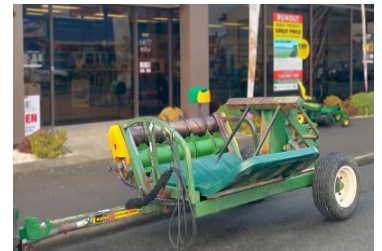
Hustler Chainless 4000 208842 (B) Chainless 4000, Feeding Out, 2010, Used $11,000.00+GST