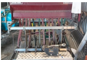
Taegre Vineyard Seeder 208159 (B) Vineyard Seeder, Cultivation & Seeding, 2010, Used $20,000.00+GST