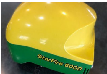
John Deere SF6000 208559 (A) SF6000, Precision Ag Technology, 2020, Used $10,900.00+GST