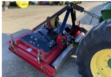
Progressive SDR-65 208618 (N) SDR-65, Mulching & Topping, 2018, 0 hours, Used $3,600.00+GST