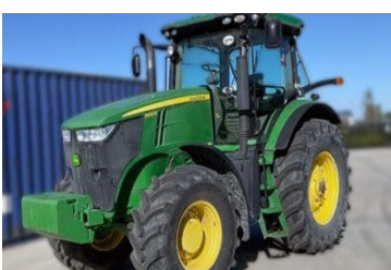
John Deere 7200R 208886 (C) 7200R, Tractor, 2013, 4590 hours, 200hp, Used, 164, 540/1000 RPM, MFWD Front Axle, $118,000.00+GST