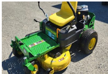
John Deere Z335E 208728 (K) Z335E, Ride-on Mower, 2017, 204 hours, 20hp, Hydrostatic, Used, $5,565.22+GST