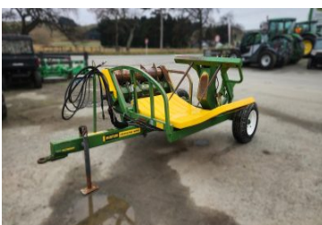
Hustler CH4000 208914 (O) CH4000, Feeding Out, 2011, Used $12,300.00+GST