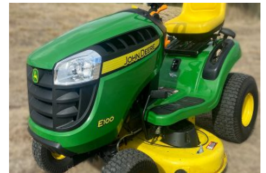
John Deere E100 208769 (N) E100, Ride-on Mower, 2020, 39 hours, 175hp, Hydrostatic, Used, $3,913.04+GST