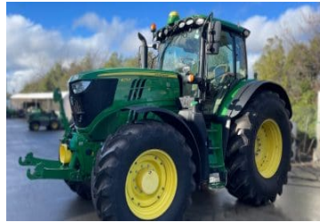
John Deere 6215R 208910 (C) 6215R, Tractor, 2018, 4946 hours, 215hp, Used, 205, 540/1000 RPM, MFWD, $194,000.00+GST