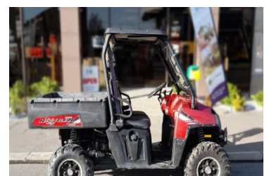
Polaris Ranger 800 EFI 208449 (K) 760, Ranger 800 EFI, Motorbike or Utility Vehicle, 2014, 4045 hours, 50hp, Used $11,500.00+GST

Hours, condition and price subject to change without notice.