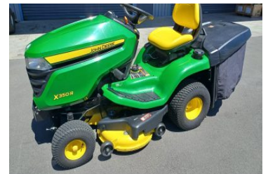
John Deere X350R 208771 (C) X350R, Ride-on Mower, 2023, Hydrostatic, 56 hours, 21hp, Used, $10,434.78+GST