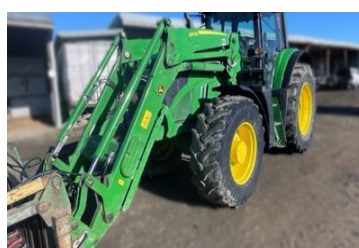
John Deere 6155M 208913 (C) 6155M, Tractor, 2020, 3695 hours, 172hp, Used, 150, 540/540E/1000, 4WD, $141,000.00+GST