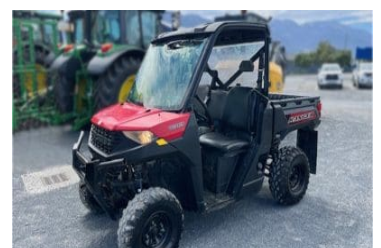
Polaris Ranger 1000 EPS 208770 (K) RANGER 1000 EPS, Motorbike or Utility Vehicle, 2020, 1576 hours, 61hp, CVT, Used $13,000.00+GST

Hours, condition and price subject to change without notice.