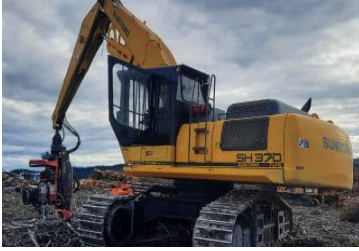
Sumitomo SH370HD-5 207813 (C) SH370HD-5, Forestry, 2018, 3660 hours, 268hp, Hydrostatic, Used $480,000.00+GST