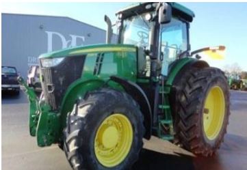
John Deere 7280R 205288 (A) 7280R, Tractor, 2011, 8150 hours, 280hp, IVT, Used, 50 km/h $87,500.00+GST