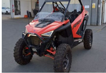
Polaris RZR PRO XP ULT 208664 (D) RZR PRO XP ULT, Motorbike or Utility Vehicle, 1000, 2020, 340 hours, 181hp, Used, $27,500.00+GST