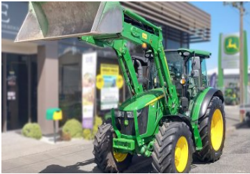
John Deere 5100R 208727 (B) 5100R, Tractor, 540/540E/1000, 2017, 1454 hours, 100hp, Used, MFWD, Command 8, 40 $115,000.00+GST