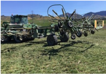
Krone Swadro 1400 Plus 208783 (C) Swadro 1400 Plus, Hay & Forage, 2016, 12000 hours, Used $69,000.00+GST