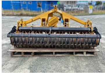
Alpego RMAX300 208720 (N) RMAX300, Cultivation & Seeding, 2017, 0hours, Used $20,000.00+GST