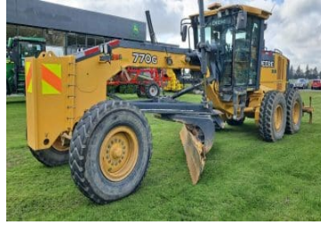
John Deere 770G 208962 (C) 14/R24, 770G, Construction, 2010, 14/R24, 9237 hours, Used $216,500.00+GST