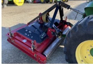
Progressive SDR-65 208618 (N) SDR-65, Mulching & Topping, 2018, 0 hours, Used $3,600.00+GST