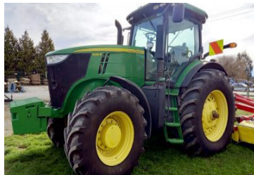
John Deere 7230R 207267 (O) 7230R, Tractor, 2013, 5715 hours, 230hp, Used, 4WD, IVT, 4 Rear SCV's, 600/70 R30, $118,000.00+GST