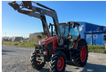
Kubota M135GX 208843 (N) M135GX, Tractor, 2013, 4257 hours, 135hp, Used, 118hp, 540/540E/1000, Unsuspended, $55,000.00+GST