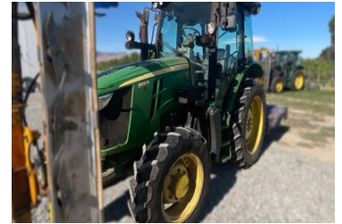
John Deere 5100R 208834 (B) 5100R, Tractor, 2018, 7508 hours, 100hp, Used, 540/540E/1000, MFWD, Command 8, $40,000.00+GST