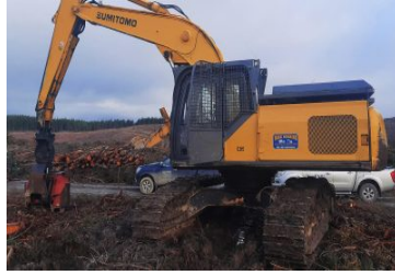
Sumitomo SH300-5TL 208296 (C) SH300-5TL, Forestry, 2015, 7500 hours, Hydrostatic, 206hp, Used $295,000.00+GST