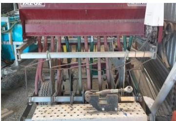
Taeye Vineyard Seeder 208159 (B) Vineyard Seeder, Cultivation & Seeding, 2010, Used $20,000.00+GST