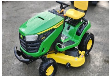
John Deere S140 208856 (O) S140, Ride-on Mower, 2023, 11 hours, 22hp, Used, Hydrostatic, $5,826.09+GST