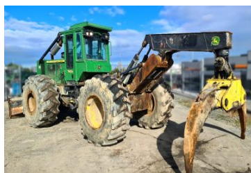
John Deere 748H 208527 (C) 748H, Forestry, 2010, 12057 hours, 189hp, PowerShift, Used, $107,000.00+GST