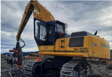
Sumitomo SH370HD-5 207813 (C) SH370HD-5, Forestry, 2018, 3660 hours, 268hp, Hydrostatic, Used $480,000.00+GST