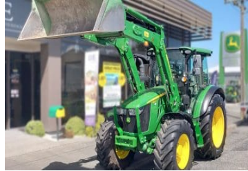
John Deere 5100R 208727 (K) 5100R, 540/540E/1000, Tractor, 2017, 1454 hours, 100hp, Used, MFWD, Command 8, 40 $115,000.00+GST