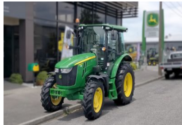
John Deere 5090R 208690 (B) 5090R, 540/540E/1000, Tractor, 2018, 2559 hours, 90hp, Used, MFWD, Command 8, 40 $80,000.00+GST