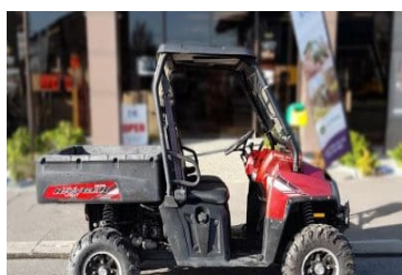
Polaris Ranger 800 EFI 208449 (K) 760, Ranger 800 EFI, Motorbike or Utility Vehicle, 2014, 1132 hours, 50hp, Used $11,500.00+GST