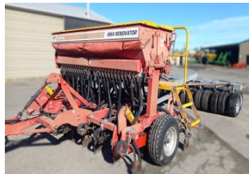
Duncan MK4 Renovator 208859 (T) MK4 Renovator, Cultivation & Seeding, 2010, Used $27,000.00+GST