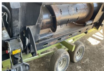
Claas P516 PICK UP FRONT 208570 (T) P516 PICK UP FRONT, Combine Harvester, 2011, Used $32,000.00+GST