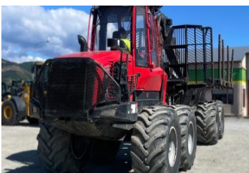
Komatsu 895-1 Forwarder 208731 (N) 895-1 Forwarder, Forestry, 2019, 4191 hours, 250hp, Hydrostatic, Used, $415,000.00+GST