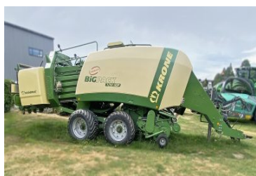
Krone Big Pack 1290 HDP 208689 (A) Big Pack 1290 HDP, Hay & Forage, 2013, 0 hours, Used $164,000.00+GST