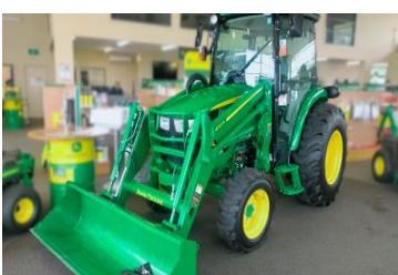
John Deere 4066R 208766 (A) 4066R, Tractor, 2023, 72 hours, 54, 66hp, Used, 540E, 4WD, Hydro two-pedal Auto, $72,000.00+GST