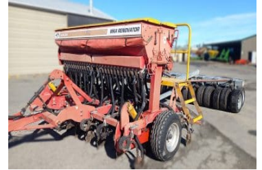
Duncan MK4 Renovator 208859 (T) MK4 Renovator, Cultivation & Seeding, 2010, Used $27,000.00+GST