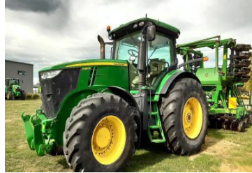
John Deere 7280R 205943 (C) 7280R, 232, Tractor, 2012, 9610 hours, 280hp, Used, IVT, 50 km/h, 600/70 R30, $76,250.00+GST