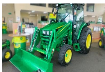
John Deere 4066R 208766 (A) 4066R, Tractor, 2023, 72 hours, 54, 66hp, Used, 540E, 4WD, Hydro two-pedal Auto, $72,000.00+GST