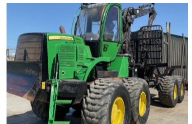
John Deere 1910E 208692 (O) 1910E, Forestry, 2017, 13433 hours, 249hp, Hydrostatic, Used, $295,000.00+GST