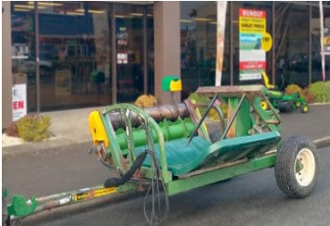
Hustler Chainless 4000 208842 (B) Chainless 4000, Feeding Out, 2010, Used $11,000.00+GST