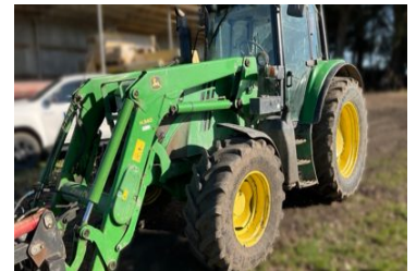
John Deere 6125M 208925 (C) 6125M, Tractor, 2014, 6619 hours, 132hp, Used, 109, 540/540E/1000, MFWD, $65,000.00+GST