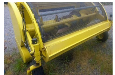
John Deere 639 Pick-up 206596 (R) 639 Pick-up, Hay & Forage, 2016, 3599 hours, Used $30,000.00+GST