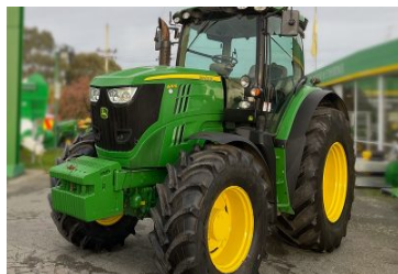
John Deere 6210R 207939 (T) 6210R, Tractor, 3, 2013, 5479 hours, 210hp, Used, TLS, AutoPower, 50 km/h, 155 PFC, 3, $125,000.00+GST