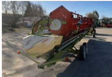
Claas Vario 1050 Header 208917 (T) Vario 1050 Header, Implement or Attachment, 2011, Used $45,000.00+GST