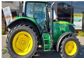
John Deere 6110M 208585 (B) 540/540E/1000, 6110M, Tractor, 2019, 1650 hours, 110hp, Used, MFWD, PowerQuad, 40 $99,000.00+GST