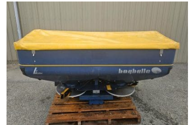
Bogballe L2 plus 208765 (T) L2 Plus, Spraying & Spreading, 2007, Used $6,250.00+GST