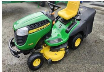
John Deere X155R 208610 (O) X155R, Ride-on Mower, 2012, 272 hours, 16hp, Hydrostatic, Used, $5,478.26+GST