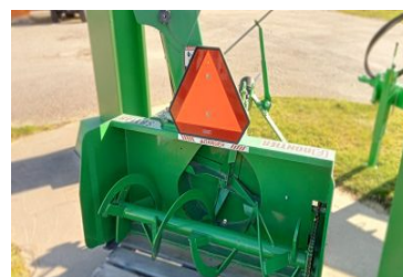
Frontier SB1148 193301 (T) SB1148, New, Miscellaneous, 2015 $3,585.00+GST