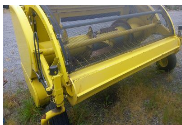
John Deere 639 Pick-up 206596 (R) 639 Pick-up, Hay & Forage, 2016, 3599 hours, Used $30,000.00+GST