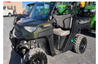
Polaris Ranger Diesel 1000 208632 (K) RANGER DIESEL 1000, Motorbike or Utility Vehicle, 2021, CVT, 801 hours, 1028, Used $23,600.00+GST