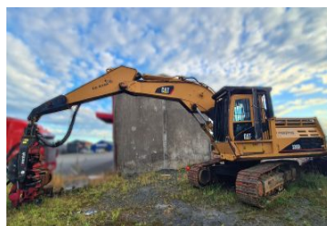
Caterpillar 330D 208526 (I) Waratah 625c, 330D, Forestry, 2009, 20391 hours, 270hp, Hydrostatic, Used, $125,000.00+GST