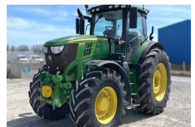
John Deere 6215R 208774 (N) 177, 6215R, Tractor, 2017, 4892 hours, 215hp, Used, 540/540E/1000E, TLS $210,000.00+GST