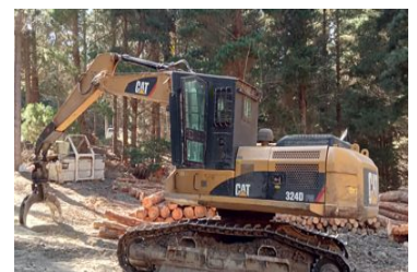
CAT 324D FM 208504 (C) 324D FM, Forestry, 2014, 9378 hours, 188hp, Hydrostatic, Used, $195,000.00+GST

Hours, condition and price subject to change without notice.