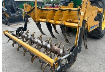
Alpego KER 300/7 208985 (C) KER 300/7, Cultivation & Seeding, 2022, Used $24,000.00+GST