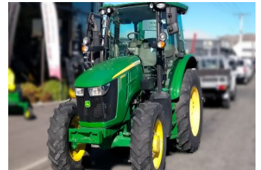
John Deere 5090R 208802 (B) 5090R, Tractor, 540/540E/1000E, 2018, 6170 hours, 90hp, Used, MFWD, Command 8, 40 $45,000.00+GST