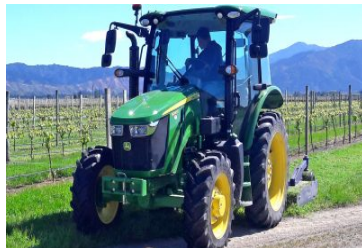
John Deere 5090R 5090RRUNOUT (B) 5090R, Tractor, 2023, DEMO hours hours, 90hp, New, Command 8, MFWD, 77, $119,900.00+GST