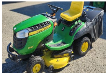
John Deere X155R 208755 (O) X155R, Ride-on Mower, 2013, 274 hours, 17hp, Hydrostatic, Used, $5,826.09+GST