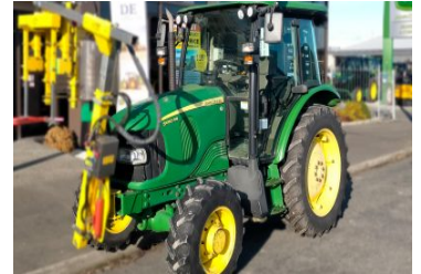
John Deere 5080RN 207825 (B) 5080RN, Tractor, 2011, 8643 hours, MFWD, 80hp, Used, PowerQuad, 40 km/h, 60 L/min, $26,000.00+GST