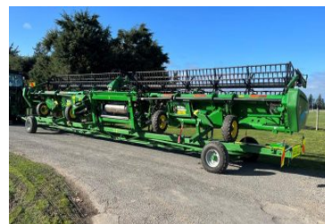
John Deere HD45X Harvester Header 124485 (A) HD45X, 2022, New $320,000.00+GST