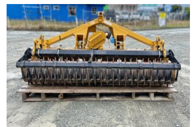
Alpego RMAX300 208720 (N) RMAX300, Cultivation & Seeding, 2017, 0hours, Used $20,000.00+GST

Hours, condition and price subject to change without notice.