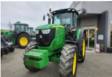
John Deere 6170R 208040 (C) 6170R, 165 HP Rated, Tractor, 2013, 6091 hours, 170hp, 540/540E/1000, Used, MFWD, $98,000.00+GST