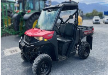
Polaris Ranger 1000 EPS 208770 (K) RANGER 1000 EPS, Motorbike or Utility Vehicle, 2020, 1576 hours, 61hp, CVT, Used, $13,000.00+GST