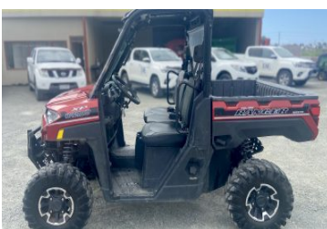
Polaris Ranger XP 1000 208679 (N) 999, Ranger XP 1000, Motorbike or Utility Vehicle, 2018, 1601 hours, 82hp, CVT, Used $15,000.00+GST