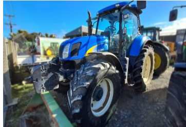
New Holland T6050 208875 (G) T6050, Tractor, 2009, 5150 hours, 125hp, Used, 3, Suspension, PowerShift, 50 km/h, 3 $49,500.00+GST