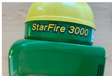
John Deere SF3000 208923 (A) SF3000, Precision Ag Technology, 2015, Used $4,373.00+GST