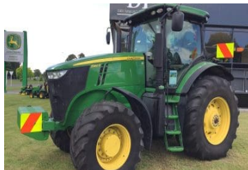
John Deere 7260R 205692 (C) 2014, 4000 hours, 260hp, 220 PTO HP, 540/540E/1000, IVT transmission. $129,250.00+GST