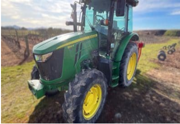
John Deere 5100R 208964 (B) 5100R, Tractor, 2019, 7633 hours, 100hp, Used, 100, 540/540E/1000, MFWD, $40,000.00+GST