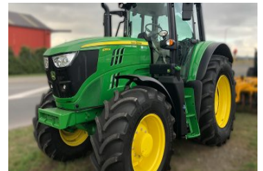
John Deere 6155M 208862 (C) 6155M, Tractor, 2023, 90 hours, 155hp, Used, 123, 540/540E/1000, MFWD, $180,000.00+GST