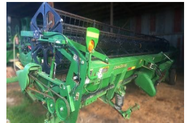
John Deere 936 Draper Front 205641 (R) 936 Draper Front, Combine Harvester, 2008, $19,000.00+GST