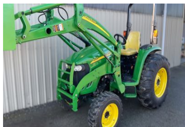
John Deere 4720 208926 (T) 4720, Tractor, 2008, 2319 hours, 58hp, Used, 50, 4WD, Hydrostatic, 36 L/min, 1 Rear $26,000.00+GST