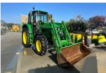
John Deere 6110M 208901 6110M, 3912 hours, 110hp, 86, PowrQuad Plus 24/24, 40 km/h, 114 L/min, Cab, 623R, $85,000.00+GST