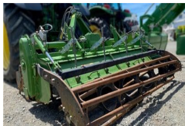
Celli Ergon 120 207764 (B) Ergon 120, Cultivation & Seeding, 1000 - 2 speed gearbox, 2009, Used $12,000.00+GST