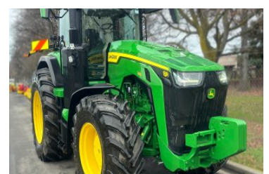
John Deere 8R340 208911 (A) 8R340, Tractor, 2022, 2351 hours, 340hp, 284, Used, ILS, PowerShift, 40 km/h, 227 $395,000.00+GST

Hours, condition and price subject to change without notice.