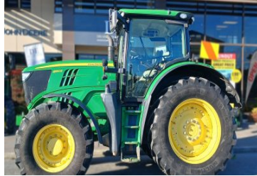
John Deere 6190R 208829 (B) 6190R, Tractor, 2014, 6327 hours, 194, 190hp, Used, 540/1000/1000E, Triple Link $105,000.00+GST