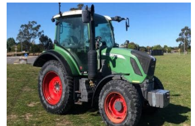
Fendt 311 208945 (C) 311, Tractor, 2017, 6004 hours, 100hp, Used, 540/1000, MFWD, 78 L/min, 4 Rear $60,000.00+GST