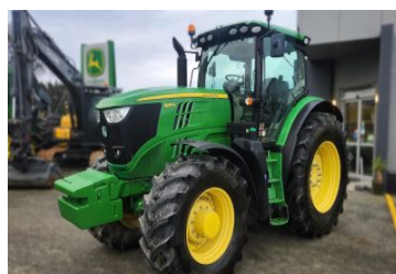
John Deere 6215R 208879 (O) 6215R, Tractor, 2016, 5800 hours, 215hp, Used, 180, 540/1000, TLS with Brakes, $130,000.00+GST