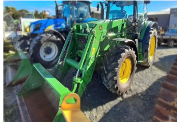
John Deere 6125R 208876 (G) 6125R, Tractor, 2013, 7250 hours, 125hp, Used, 3, Front Axle Suspension, AutoQuad, $69,000.00+GST