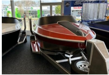
460 Escape & Trailer 208495 (D) 460 Escape & Trailer, Watercraft, 2022, 10 hours, Used $108,695.65+GST